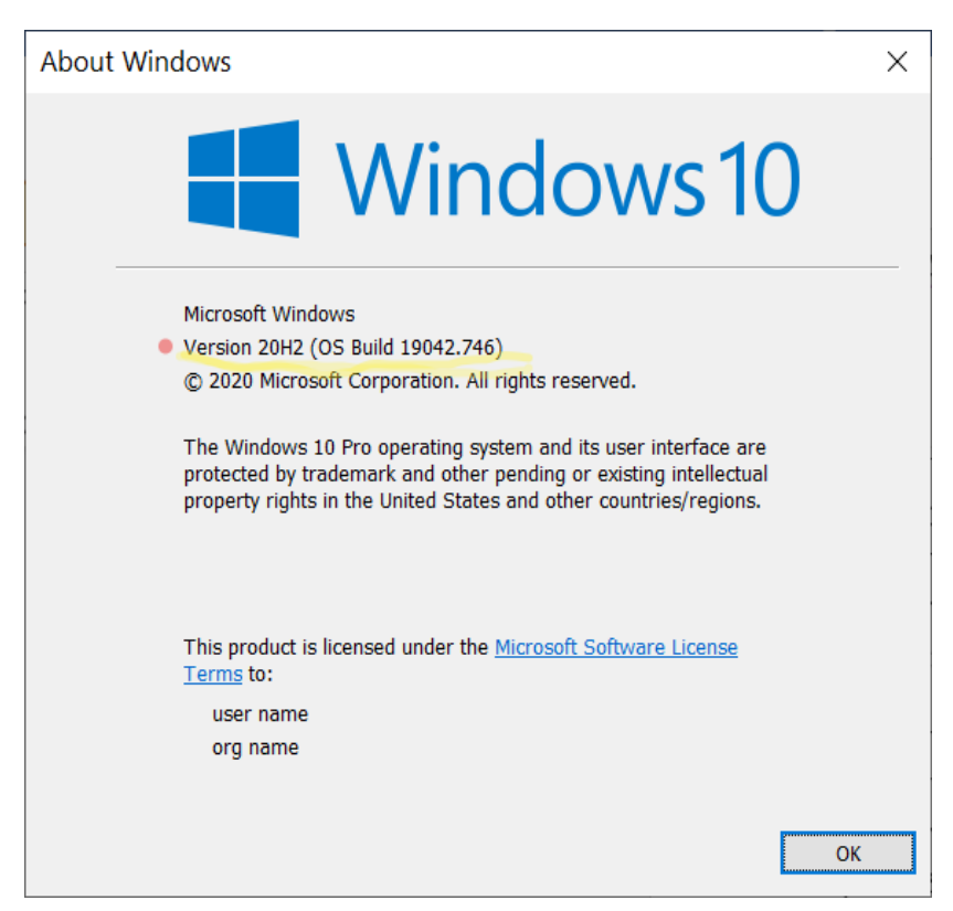
This example shows "Version 20H2"

The version numbers aren't so much numbers as they are the approximate date when a version was first released. It's probably more accurate to call it the date the version was finished, because it's typically released a month or more after that date.