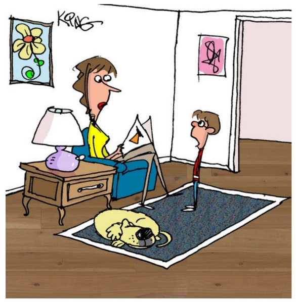
"I just finished high school and college online. Now can I play my video game?"