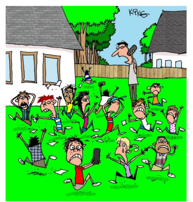
"Our Wi-Fi went down at our tech camp. It's total anarchy here. Send help!"