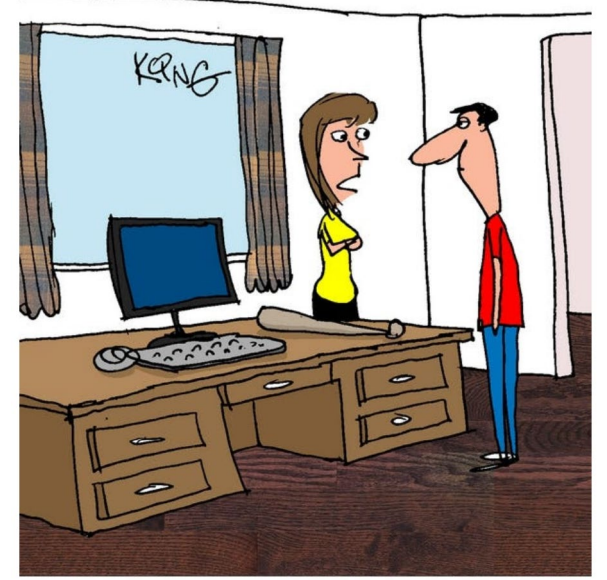
"This is your frustration computer. Whenever your actual computer makes you mad, take it out on this one. It's not real, and it's made of soft material."