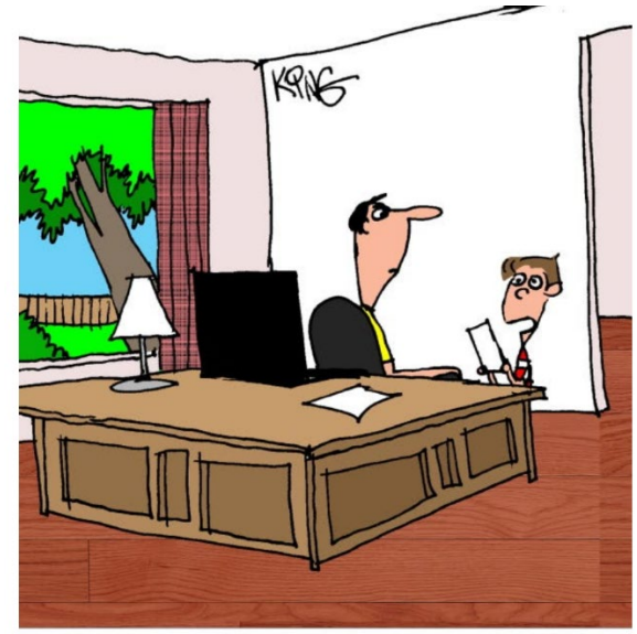
"I've estimated that I've given you over $100,000 in tech-support over the years. Since you're my dad, I'll give you a discount. I'll take a skateboard."