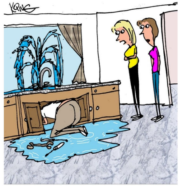
"Maybe now's not the time to tell him his data has also been leaked."