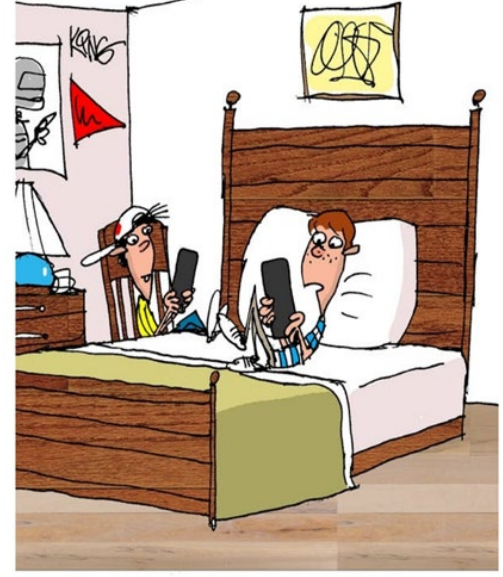
"I'm glad my phone battery died. My autobiography needed some drama."