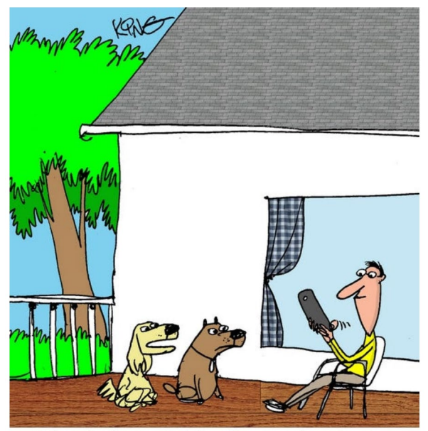
"If we had invented the phone and computer, we would be at the top of the food chain. What a blown opportunity."