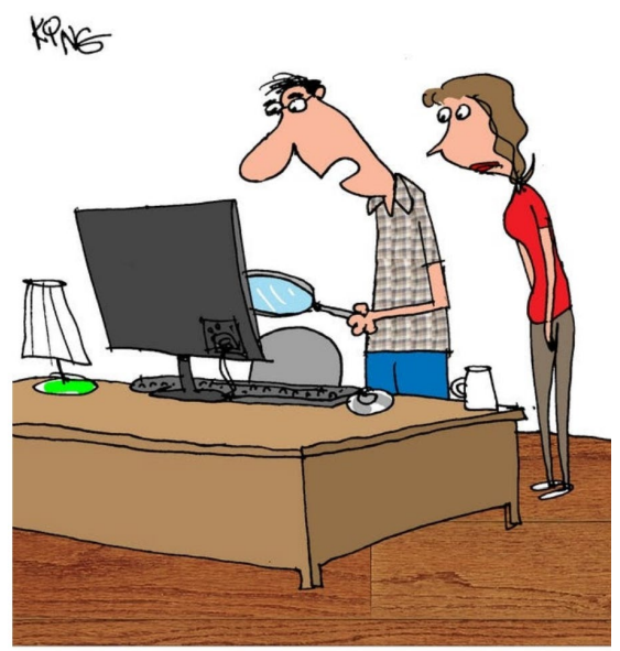
"I see balloons, food and drinks. Not only are there ants in our keyboard, they seem to be having a party."