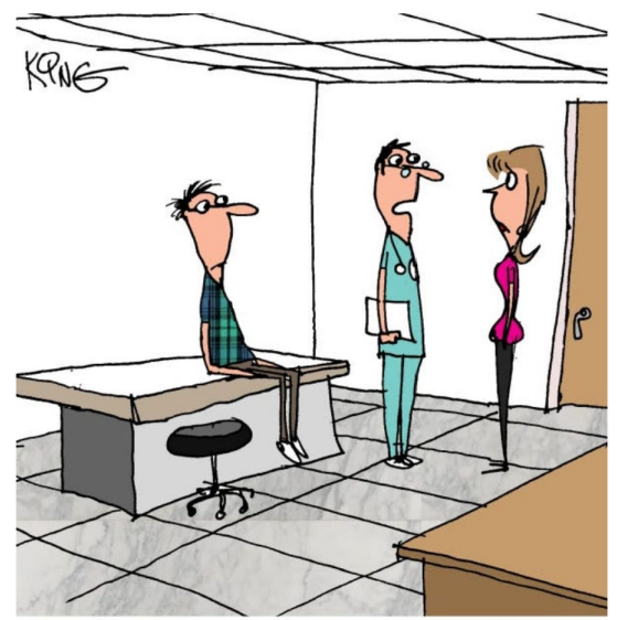
"Our brains are similar to computers. Your husband's brain is like an old computer. It locks up, lacks memory and is filled with useless stuff."

Paste this link in your address bar to read the ReviewGeek article: <u>https://www.reviewgeek.com/72901/what-to-look-for-in-a-laptop/</u>